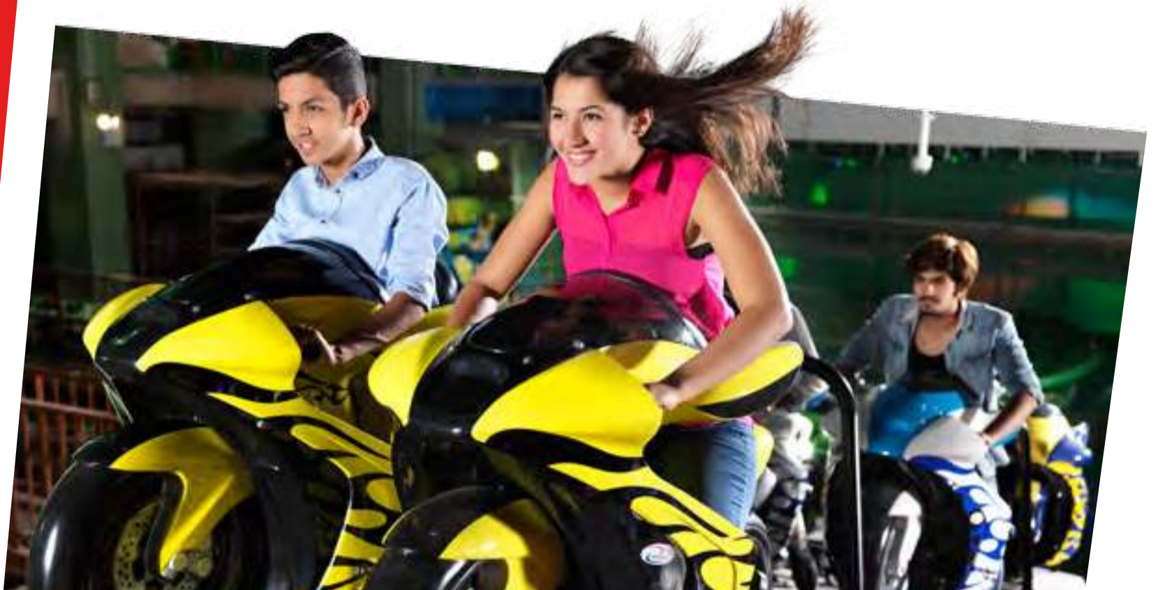
The brand new Gravity Moto Coaster

More excitement guaranteed with the addition of another fun-packed roller coaster