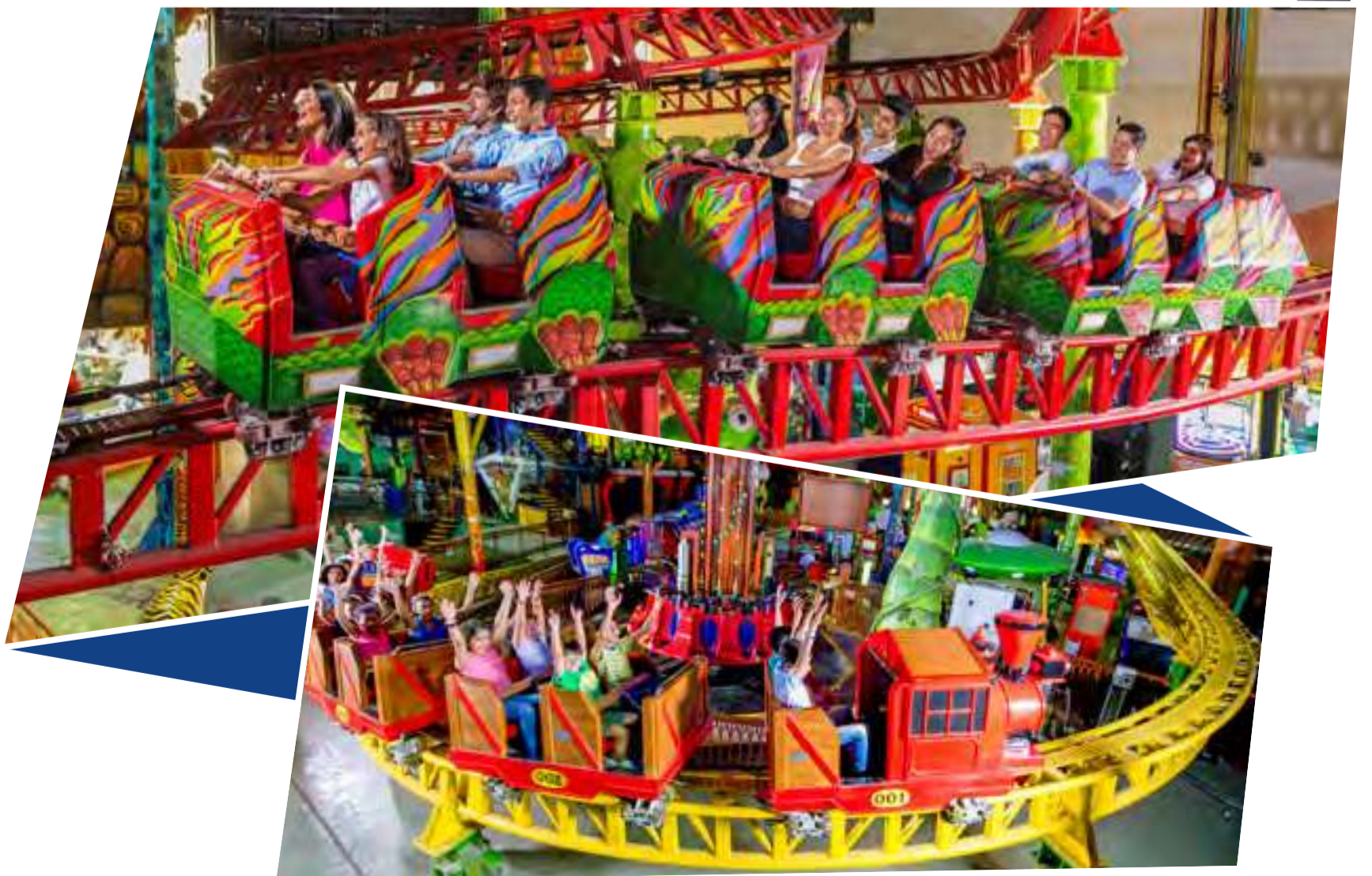
The two "refreshed" Powered Roller Coasters

direction, as they travel at speeds of up to 47km/h. The addition of the Gravity Moto Coaster coincided with a general refurbishment programme within the FEC which also saw a 'refreshing' of the two existing powered roller coasters, in addition to work on a Jumping Star and a Demolition Derby. So now, with no less than three coasters from Zamperla, Adventureland really is the place to visit for some fun, thrilling, adrenalin pumping experiences!