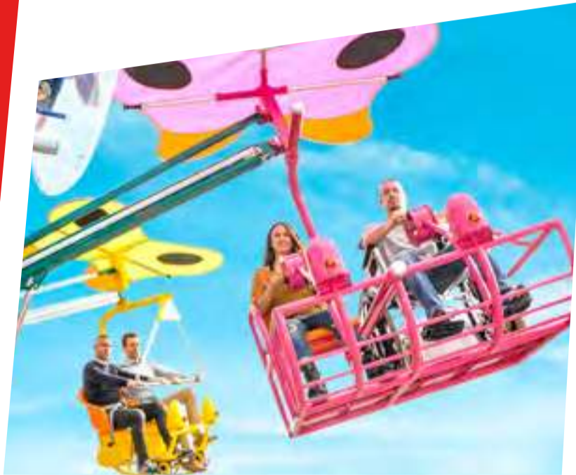
Magic Bikes' new All Access vehicle.

Having viewed Zamperla's Magic Bikes All Access model at the IAAPA Expo in Orlando, Al Hokair will include the ride in its FECs