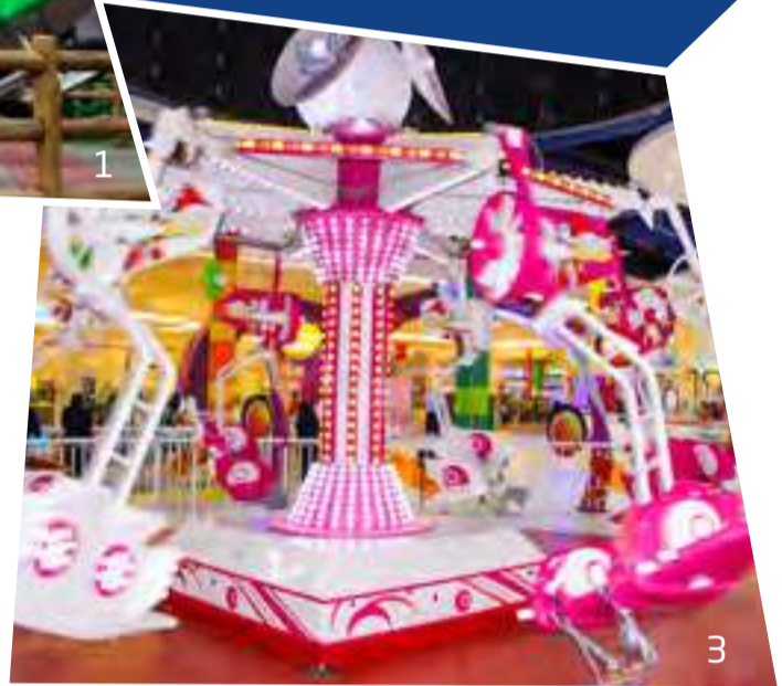
1 - The Sky Race at Taman Safari - Indonesia 2 - The Sky Race during its launch at IAAPA 2013 3 - The Sky Race in one of Sparky's FEC by Al Hokair.