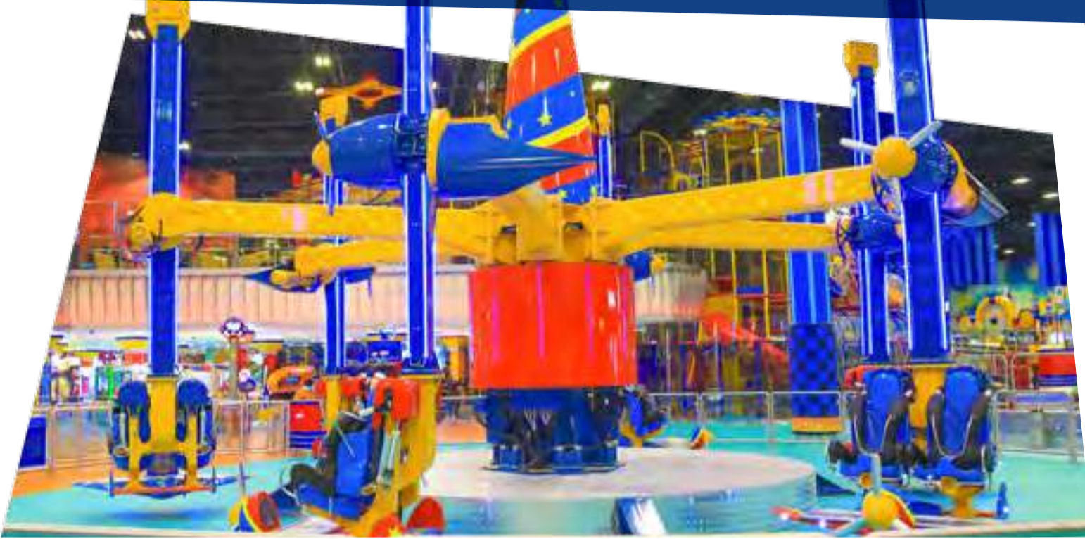
New "Fun Works" look" for the Air Race 6.2 and the Sky Tower 15 m.

The thrill levels are particularly high at the Fun Works FEC at the Yas Mall in Abu Dhabi where an Air Race 6.2 and a Sky Tower 15m from Zamperla are in operation. Operator Landmark Group describes Fun Works as 'the ideal house of play and learning and is assimilated with state-of-the-art equipment' and there is little doubt that the installation of the Air Race and Sky Tower adds some real state-of-the-art fun and thrills to the variety of rides and attractions on offer. Landmark's creative team designed special colour and lighting schemes for both attractions which were brought to life