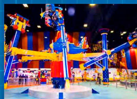
Air Race 6.2